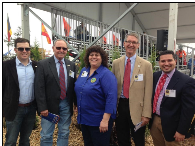
^ Above - Grand Jury Awareness Month