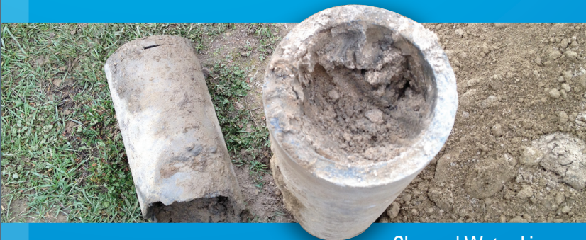
Clogged Water Line

Tulare County has a large number of public water systems unable to provide safe drinking water. The vast majority of these systems are in disadvantaged or severely disadvantaged communities which lack the resources to fund preliminary design and/or engineering in order to develop sustainable solutions.