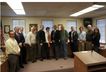
Lindsay and County planning staff were present at the MOU signing.

Tulare County and its eight incorporated cities have been in negotiations for four years to agree upon Memoranda of Understanding that outline how to implement city development standards around cities within urban development boundaries. These MOUs are intended to establish new urban development standards in unincorporated areas adjacent to current city limits so new development will meet city standards.