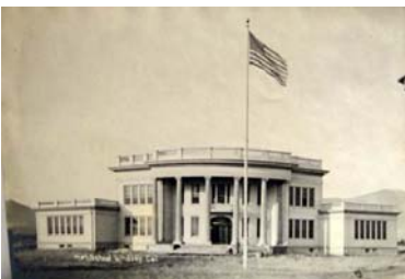
Lindsay High School