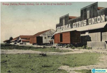
Lindsay Orange Packing House