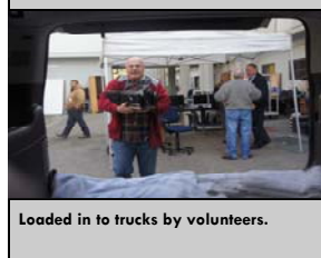
Loaded in to trucks by volunteers.