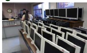
Computers were picked up at the County Surplus Store.

County staff, Rotarians and other volunteers met at the Tulare County Surplus Store on Dec. 14 to load up vehicles with the computers and delivered them to students Countywide.