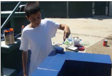
Service learning participant paints dugout at Green Acres.