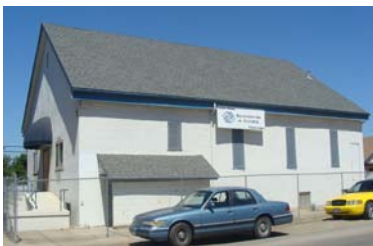
The youth center is at the corner of Azalea Ave. and Rd. 159

The $200,000 grant award will be used to repair and renovate a building recently acquired by Tulare County, which will be operated by the Boys & Girls Clubs of Tulare County as a youth center. The funding will be used for construction of a games room, classroom, computer learning center, art room, "Kids Café,"