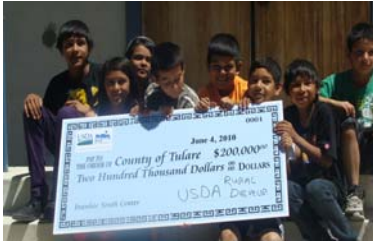
Ivanhoe's youth attended a check presentation ceremony.

"This is such an exciting project; not only because it will provide a beautiful new building for Ivanhoe's youth, but because the entire community – the county, the surrounding farmers, those who used to live in Ivanhoe,