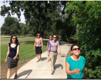
Auditor/Controller employees walk in record steps.

More than 680 Tulare County employees from 23 departments participated in the 2nd Annual Walking Works Challenge in May. For the whole week, more than 28.6 million steps, or 8,711 steps per day, were taken by Tulare County employees!