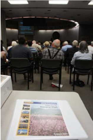
Dozens of residents attended the General Plan 2030 Update public hearing

Tulare County now has an updated general plan.