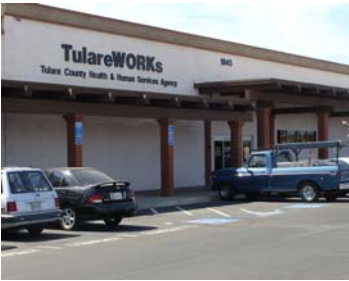
The new TulareWORKS Office is located at 1845 N. Dinuba Boulevard in Visalia.