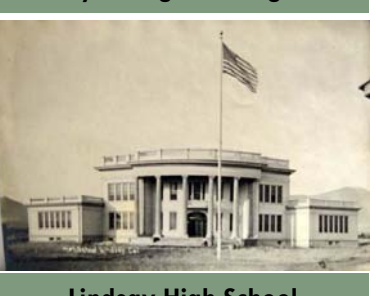
Lindsay High School