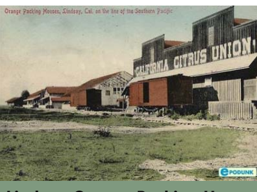
Lindsay Orange Packing House