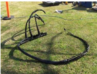
Crews pulled melted wire, conduit from exterior vault.