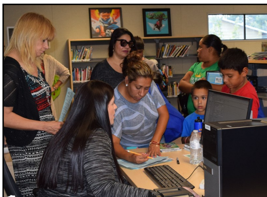
Signing up for Library Cards.

October 15 was a BIG day in the community of London - The Library opened! The day was full of speakers; presentations; kids activities; a resource fair; checking out library books; getting library cards; and of course the power of reading! Check out photos from the grandiose event.