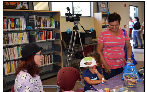
Fun activities available at the NEW London Library.