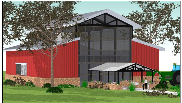
Tulare County History of Farm Labor & Agriculture Museum

TCOE brings a wealth of experience to the project in