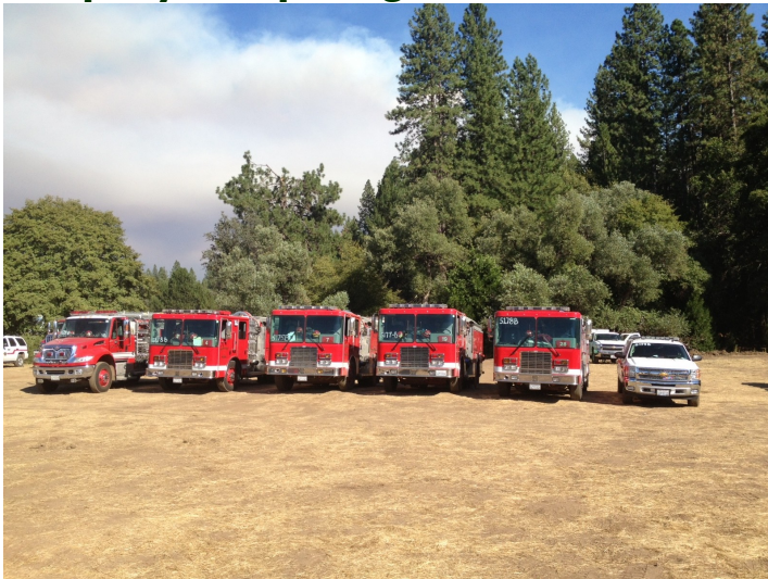
Pictured: One of three strike teams sent to Rim Fire.

Three Tulare County Fire Department-led strike teams helped fight one of the largest wildfires in California's history in late August.