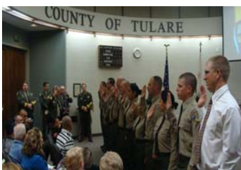
Twelve deputies were sworn in on October 12, 2009 in Visalia.